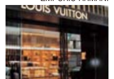
LOUIS VUITTON Store