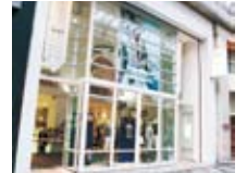
ROPÉ Le Marche Blanc