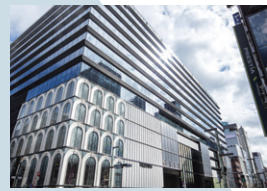
April 2017 Ginza Six opened