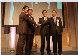
September 2007 Established J. Front Retailing

• Acquired Matsuzakaya in Ueno and renamed it "Ito Matsuzakaya" to enter into Edo