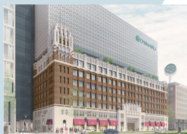
Rendering of new main building of Daimaru Shinsaibashi store