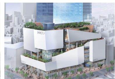
November 2019 Rendering of Shibuya Parco ©2019, Takenaka Corporation