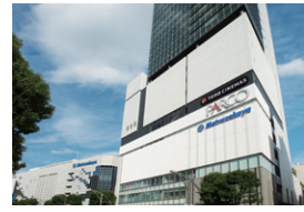
November 2017 Ueno Frontier Tower opened