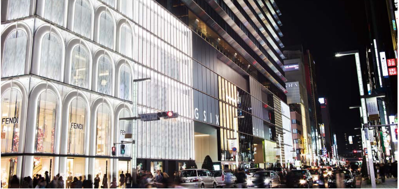
Exterior of Ginza Six