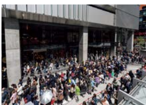
People in line at opening

Another feature of this project is a great deal of attention from the media. In April when it opened, the total number of media exposures including