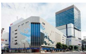
Matsuzakaya Ueno store and Ueno Frontier Tower

This is the first big development project jointly implemented by Daimaru Matsuzakaya Department Stores and Parco. The initiatives of Daimaru Matsuzakaya Department Stores and Parco achieved a certain result in joint sales promotion and others in the areas where the stores of the two companies are adjacent to each other. And we think this project led us to enter into a stage where the Group synergy with Parco shifts into full swing in more situations. The new Parco store opened in this “Ueno Frontier Tower” was named “Parco_ya,” which is an example of new initiatives with unprecedented concept. Specialty shops there were selected to attract the customers who visit the adjacent Matsuzakaya Ueno store or Toho Cinemas Ueno and workers in offices on upper floors. “Parco” opened a store in a new area in the 23 wards of Tokyo for the first time in 44 years. Under the new name “Parco_ya,” the store contributes to tapping a new market in the area with a brand lineup suitable for the surrounding environment and catering to a little