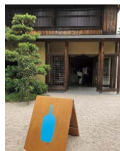
Blue Bottle Coffee Kyoto Cafe

promotion programs for developing the areas around department stores and motivating people to visit the areas in collaboration with local communities to promote the Urban Dominant Strategy for growing with local communities.