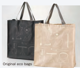
Original eco bags

We provide training based on a smart wrapping manual so that all workers can pack in an unwasted and appropriate manner. Our stores promote simple packaging and “one-bag campaign” to put all stuff in one bag with the cooperation of customers.