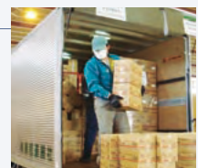
Aid delivery to Iwate

We provided Ofunato-shi, Iwate, with 1,000 blankets, 200,000 masks, portable toilets and radios through the NGO "Peace Winds Japan" immediately after the earthquake occurred. After that, we asked the earthquake headquarters of each affected prefecture