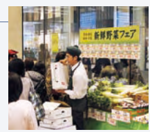
Vegetable fair (Daimaru Tokyo store)

Daimaru Tokyo, Matsuzakaya Ueno and other stores held "support fairs" to sell fresh vegetables grown in and local sake brewed in the Tohoku and Kanto areas.