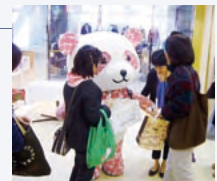
In-store fundraising activity (Matsuzakaya Ueno store)

We raised money in all locations of Daimaru, Matsuzakaya and Peacock Stores and donated a total of about ¥38 million together with the donations from the employees of the Group and workers from suppliers to the Japanese Red Cross Society.